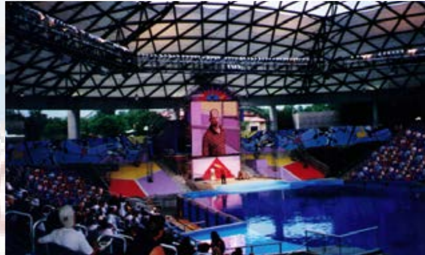
Billy dazzles thousands in Shamu Stadium at Sea World

Standing ovations from thousands of adults... or giggles from a dozen first-graders... or cheers from hundreds of teenagers, Billy touches audiences of all ages. Thousands of shows in all 50 states, 12 cruise ships, on 5 continents.